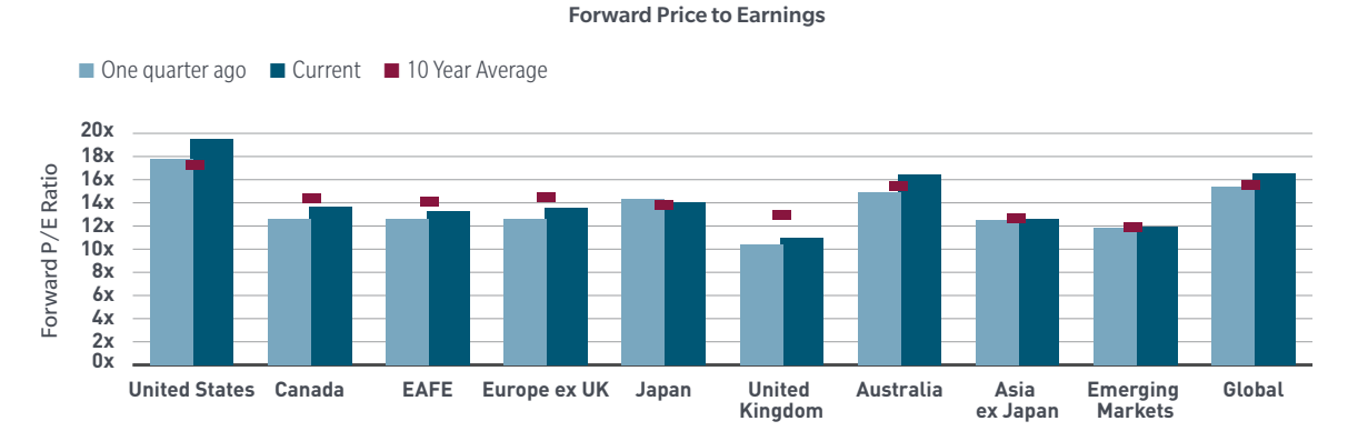
Source: FactSet as of 29 December 2023. United States = S&P 500, Canada = MSCI Canada, United Kingdom = MSCI United Kingdom, Japan = MSCI Japan, Australia = MSCI Australia, Global = MSCI AC World, Europe ex UK = MSCI Europe ex-UK, EAFE = MSCI EAFE, Asia ex Japan = MSCI Asia ex Japan, Emerging Markets = MSCI Emerging Markets.

Moderating global inflation pressures, signs that central banks will begin cutting interest rates in 2024 and growing hopes for a US soft landing helped spark a sharp rally in global equities in late 2023. For the calendar year, developed market equities rose just over 21% in 2023, led by solid gains in US and Japanese shares. A growing view that easier US Federal Reserve policy is likely in 2024 helped put an end to an episode of dollar strength, which could provide a tailwind for the earnings of US-based multinationals. Given international equities' lower earnings multiples, the 2023 rally brought valuations back in line with their 10-year average. However, considering the market's aggressive pricing of easier global monetary policy this year, there is the growing risk of disappointment if inflation proves stickier than expected. There is also a risk that the late-2023 rally pulled forward returns that otherwise might have been realized in 2024. We continue to favor international equities over those in the US and view midcaps more favorably than small caps. Value remains attractive from an earnings multiple perspective, though we prefer defensives over cyclicals.